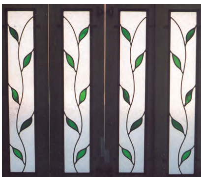
Opalescent Green Leaves with Glue Chip Background App. 7" x 30" each, San Pedro, CA, 2005