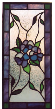
Multi-colored Flowers and Leaves, Closet Window, app. 11" x 18" Redondo Beach, CA, 2003