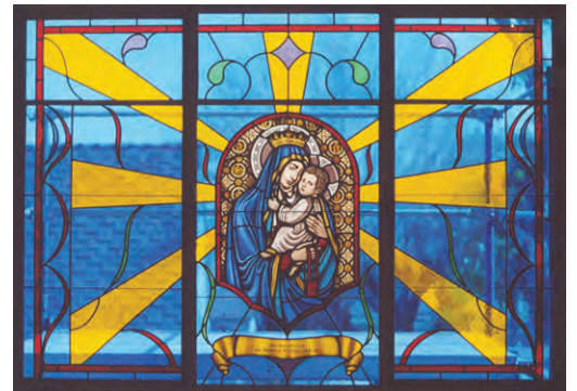
"Our Lady of Mt. Carmel" Chapel Window, Rectory St. Therese Catholic Church, Alhambra, CA app. 6' x 4'