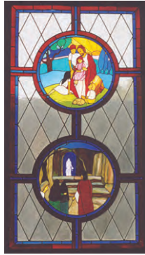
Stained Glass Restoration St. John Vianney Chapel Balboa Island, Newport Beach, CA app. 6' x 4'

The wooden frames are being refurbished and re-finished while the glass is worked on.