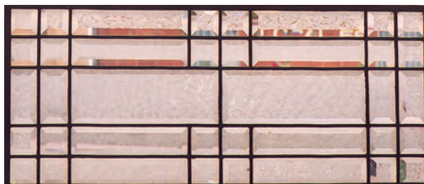
Craftsman Design Door Insert to Complement Craftsman Architecture Long Beach, CA, 2004