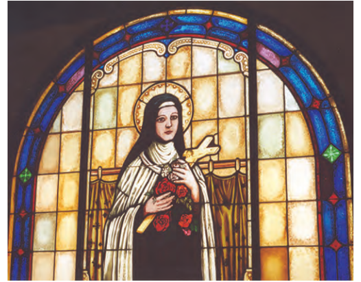
Restored Choir Loft Window in New Frame Santa Teresita Catholic Church Los Angeles, CA, 2005 app. 6' x 5'