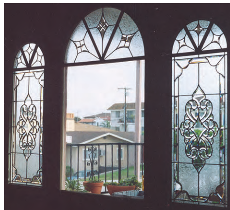
Leaded and Beveled Glass View from Living Room, San Pedro, CA, 2005