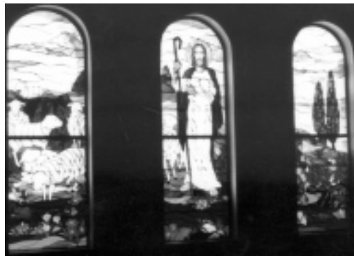
The Good Shepherd Sacred Heart Catholic Church, Pomona, CA, chapel, 1988