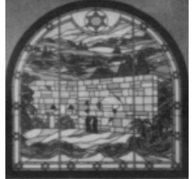
Wailing Wall, Jerusalem Stained Glass Window in Chapel Community Mausoleum, Mount Lebanon Cemetery Glendale (Queens), New York, 1994