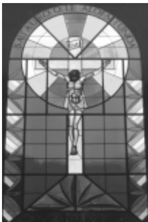
Crucifixion Window Congregational Christian Church, American Samoa, Fagasa Village, 1990