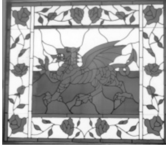
Welsh Dragon with Roses Rolling Hills, CA, residence, 1987

The people, the places, the projects, the adventures ... the joy of creation and the kindness of your patronage — the past 25 years have been a fantastic journey. We are looking forward to many more years, but first, here are some highlights from the past.