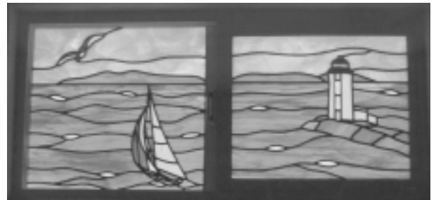
View of Catalina and Angels Gate, San Pedro, CA, residence, 2004