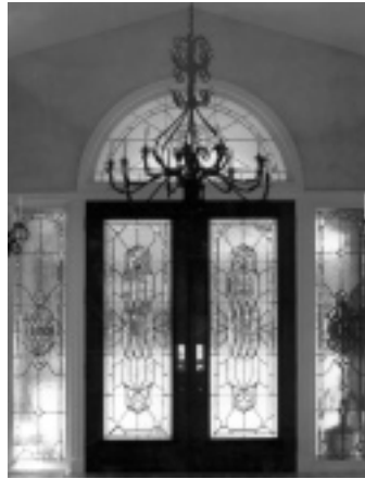
Beveled Glass Entryway Rancho Palos Verdes, CA, residence, 1993