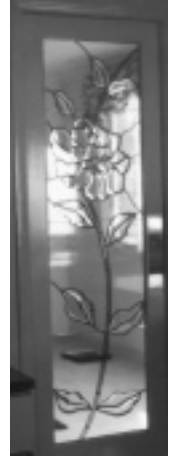
Interior Door Calabasas, CA, residence, 1995