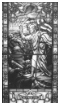
Resurrection St. Anthony of Padua Catholic Church, Gardena, CA

Among other features, you can see examples of our work in the residential, commercial, church and cemetery areas; read letters of reference; and read past issues of the "Cutting Edge Quarterly."